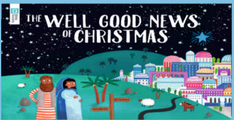
POP UP NATIVITY

Come on Sunday, Dec 15th at 11.00am and get involved in an interactive version of the Christmas story with carols. You can even dress up as a character from the Christmas story! Fun for all!