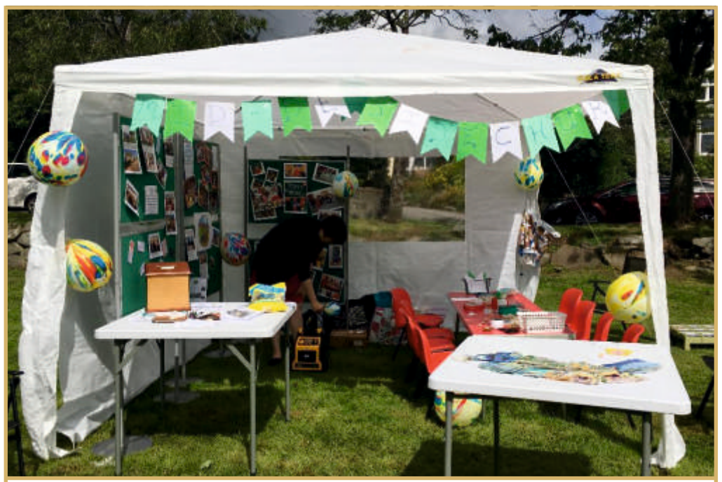
Preparing the Craft Tent at Torphins Gala