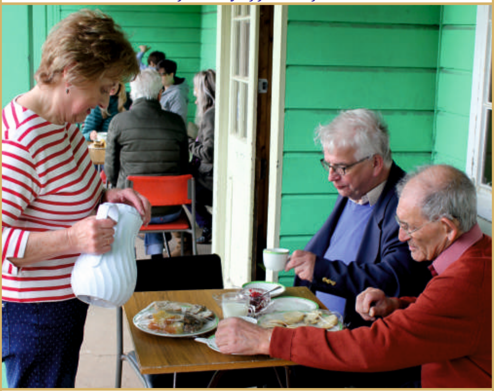
There's allways time for a cuppa and a fine piece