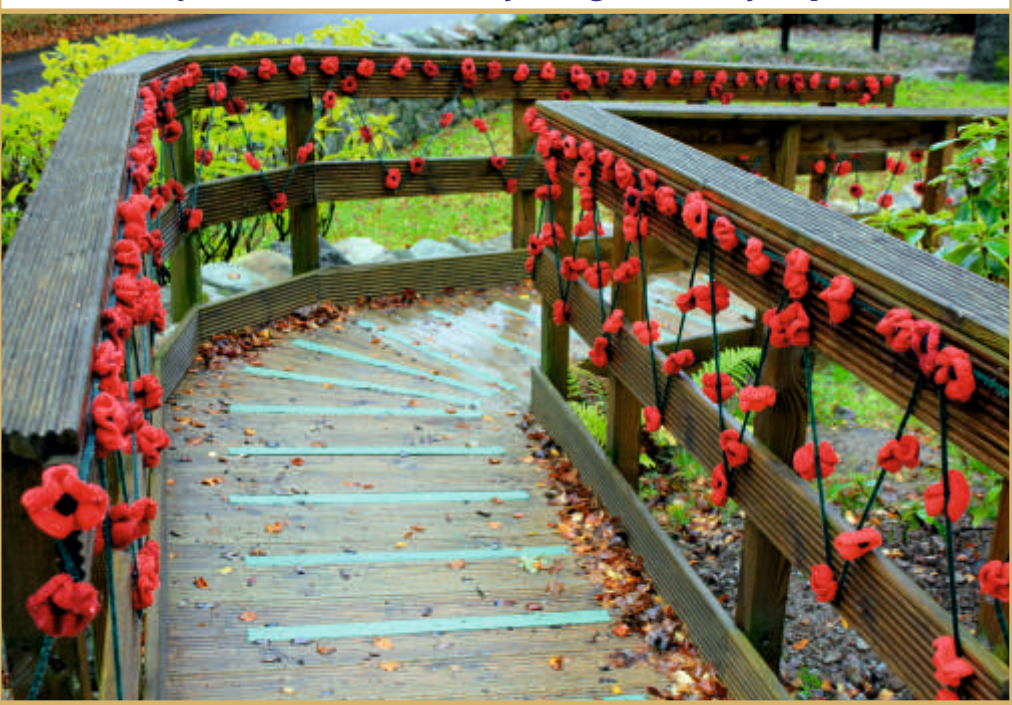
Walk way decorated for Remembrance Sunday