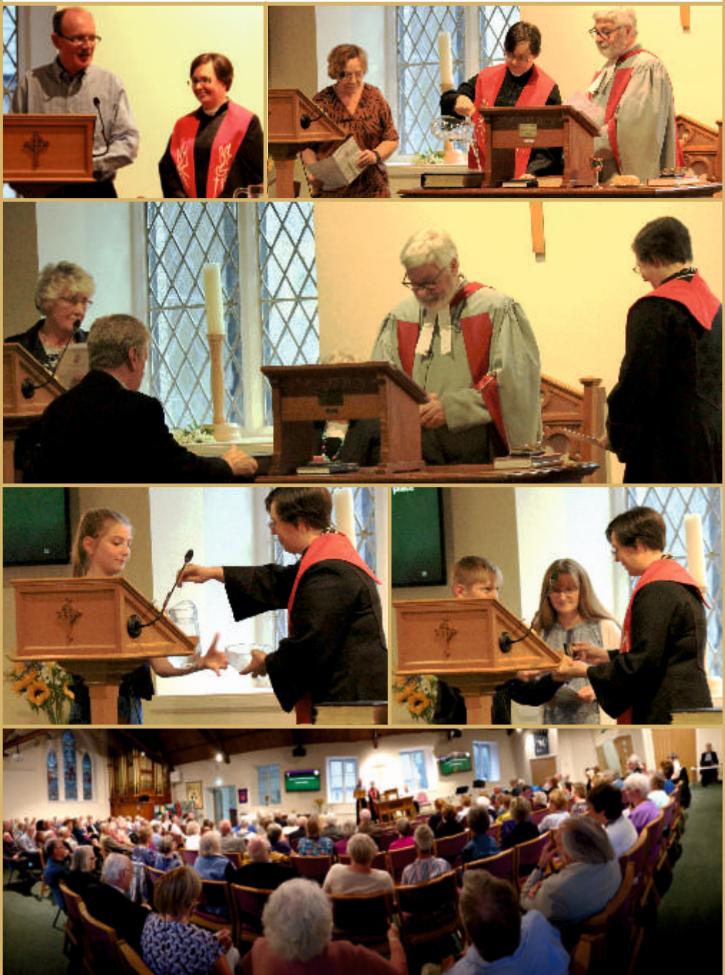
Fish-Eye Lens view of the congregation