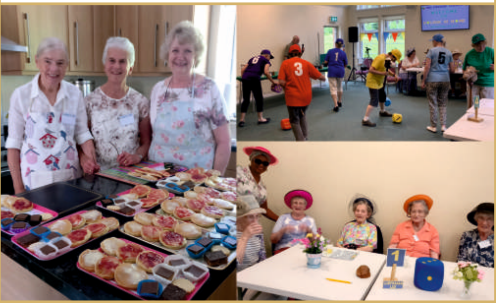
Holiday at Home 2019 - usual fun & games and fine pieces